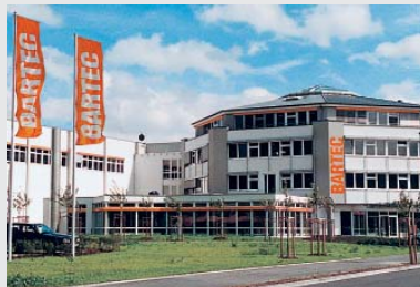
Headquarters in Bad Mergentheim

Our innovative spirit and consistent product development are the basis for innovative solutions and exemplary performance at BARTEC. BARTEC sets standards in safety technology worldwide.