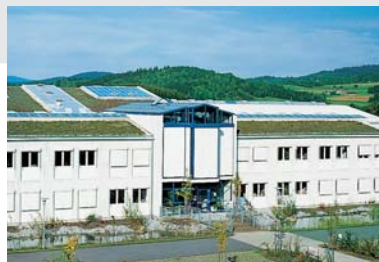
Site BARTEC BENKE Gotteszell